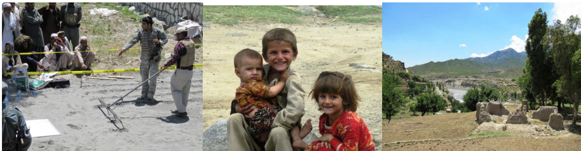
*Above left: Aid agency showing how to plant short corn before giving out seed to local farmers (Afghan National Army [ANA] and Afghan National Border Police [ANBP] provide security). *Above center: Some cute kids (and yes, there are ugly kids), just a few that mobbed our vehicle during the corn distribution. *Above right: Ruins are found all over this country its creepy and fascinating at the same time.

We made our way out to the local village without incident. I handed off my duffle bag of supplies to our Latvian 1 st Sgt. and my camera to our interpreter (Taking photos can offend many Afghans, our interpreters have a much easier time of putting local people at ease). Afterward I returned to my driver's seat greatly anticipating the pictures of the Afghan Commander handing the supplies out to smiling children. These thoughts took my mind off the Russian and English languages talking simultaneously in my headset. I was brought back by the sound of someone knocking on my bullet resistant window. It was our interpreter. I opened the door and asked what was going on? He handed back my camera and began sincerely apologizing. I was told our 1 st Sgt. had decided to give my bag with the supplies to the Afghan commander and let him go alone with the American officers to the meeting. The interpreter and the rest of the team realized this was a bad decision and I was not a happy camper. Our function is as mentors to the Afghan leadership and liaisons to the American army none of which could be done if all of us were performing security while the meeting went on across the river from us. On top of that the Afghan platoon leader in charge was known as not the sharpest marble if you catch my drift.