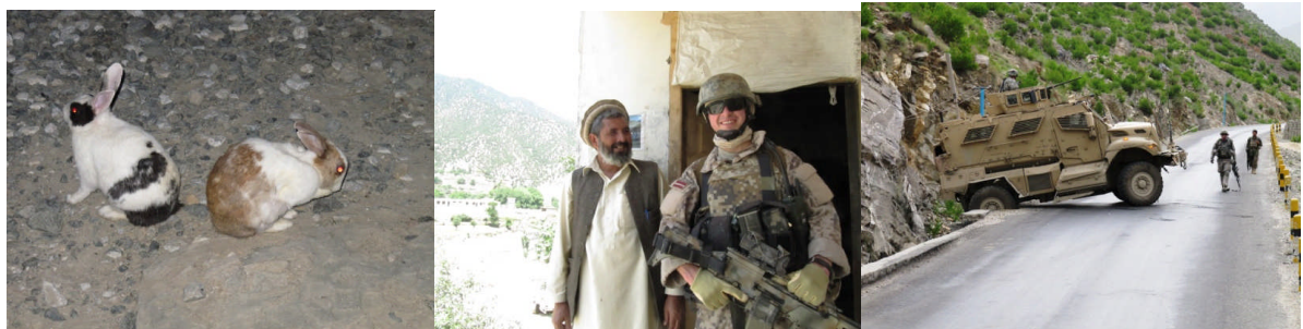
*Above left: Demonic red eyes; further proof the local bunnies are up to no good. *Above center: Teams second in command posing with local shop owner. *Above right: Oops, the American MRAP vehicle got stuck (we kinda laughed and filmed the entire process of them destroying a little of the Afghan road system, eventually freeing themselves).

Recently I have become "Mr. Amazon.com", ordering tons of stuff for my teammates that would cost them two or three times as much in Europe. They all are trust worthy and have paid me. Unfortunately, while I'm ordering them stuff I tend to order myself things I don't need. Now Latvians from other teams have started approaching me. It's so nice to be needed... I guess.