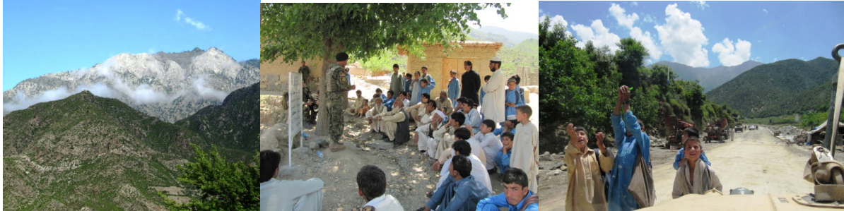
*Above left: Low clouds rolling into the local mountains. *Above center: ANA Commander speaking to local villagers (In summary; Don't start shooting at us and if you already are please stop!). Above right: While on security, our turret gunner throwing out pens (generously provided by many of you) from the above to passing school children.

were a few adjectives in there I left out). I was greeted by wonderful silence... too much silence. Feeling something had gone wrong, I felt the control box in the darkness and realized instead of switching the net control dial I had simply turned the dial to my headset volume up. I was still talking to the American Army! Not only that, I had screamed so loud my entire team had heard the me even if they were outside the HuMMV. Strangely enough none of the American's we were out with ever mentioned my little outburst and I was too embarrassed to bring it up. I eventually resorted to turning the Latvian radio off after I would transmit something, turning it back on when the Americans had finished speaking.